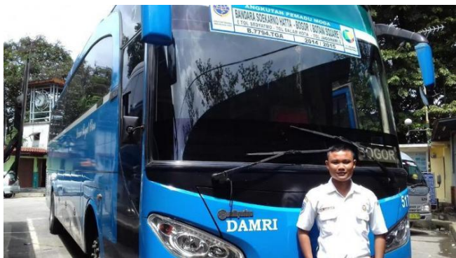
Damri bus Seokarno Hatta Airport-Bogor

Each terminal in Soekarno Hatta International Airport has DAMRI bus station. Take the bus with a destination to Bogor (cost IDR 55.000). The travel time will be around two hours but it also depends on the traffic situations. Then get down at Botani DAMRI station Bogor. From the station to the hotel you can take a taxi (cost IDR 15.000-25.000) or Mobile app transportations (gojek, grab, etc.), it's actually quite close from the bus station (see google map)